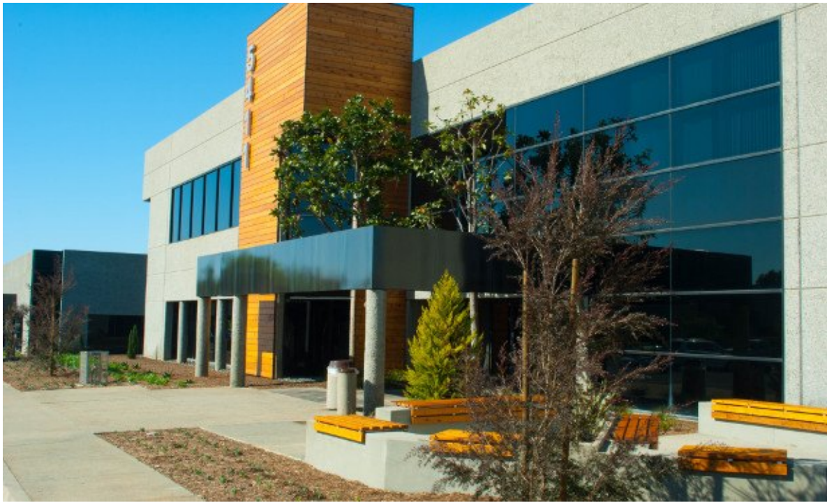
Ocean Point features a bold design and is close to the beach.