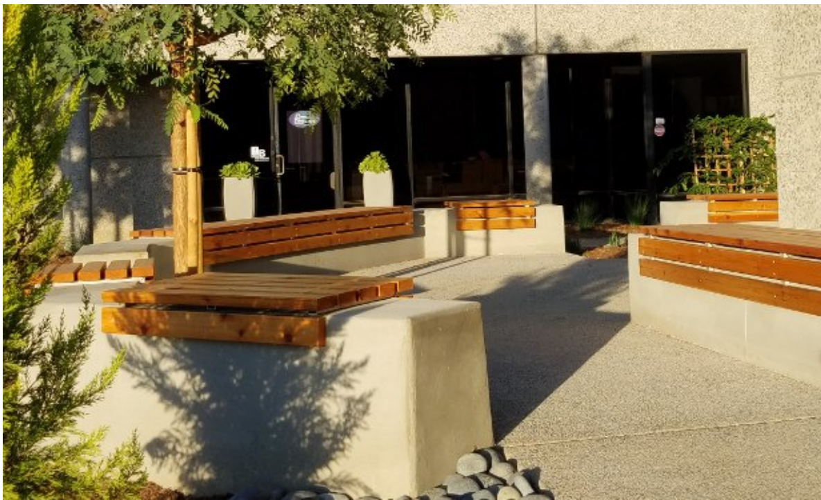
Common areas outdoors take advantage of the great Carlsbad weather and the synergistic vibe among tenants.